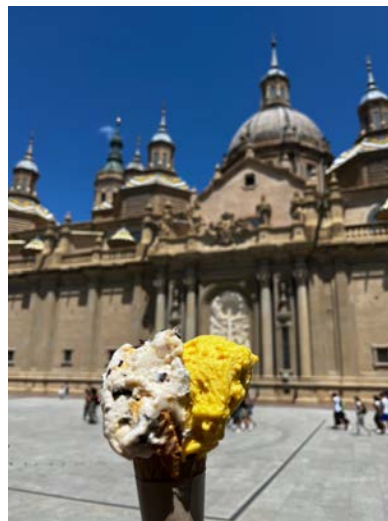
Gelato in Pilar Square