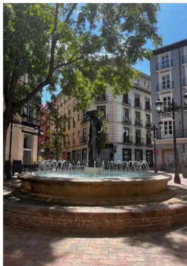
Plaza del Justicia

On our way to Madrid, we made a stop in the city of Zaragoza, a city in the autonomous region of Aragon. We explored the city and had lunch in the Plaza del Justicia, then gelato in Pilar Square.