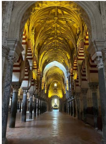
Mosque – Cathedral of Cordoba

During the third weekend of the program, we left Granada for a weekend in Cordoba and Sevilla. When we arrived in Cordoba, we visited the Mezquita of Cordoba. In Sevilla, our morning consisted of a tour of the Alcazar, a Moorish royal palace, and the Plaza de España. Sevilla was one of my favorite cities that we visited in Spain, and as a huge Star Wars fan, I was delighted to have been able to visit one of the filming spots from Episode II. This picture from the film lined up perfectly with a picture I took of the Plaza. In the afternoon, we had a tour of the Seville Cathedral.